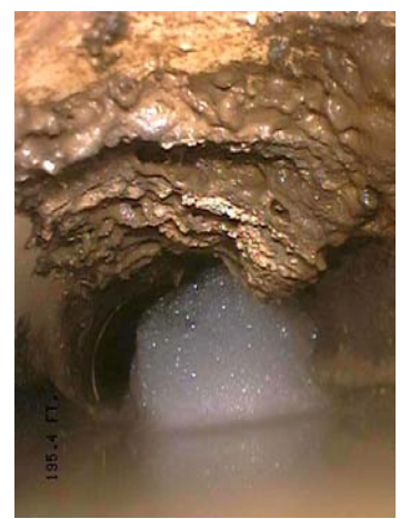
Inside of a sewer line with soap bubbles floating on the wastewater and FOG hanging from the ceiling of the pipe. The diameter of the sewer pipe is reduced by the FOG, creating a potential site for a blockage.